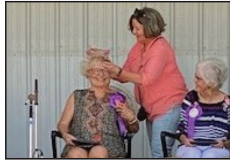
ARGYLE RESIDENT IS HONORED AS AN OUTSTANDING MARSHALL COUNTY SENIOR CITIZEN

Argyle Mall, Box 17, Argyle, MN 56713 (218) 437-8431 • arglah@wiktel.com