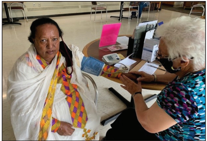
BLOOD PRESSURE CHECK HOSTED BY ST. ANTHONY PARK AREA SENIORS

The 32 member programs of the Living at Home Network (LAHN) have helped older adults navigate the coronavirus (COVID-19) pandemic through creative outreach that reduces the social isolation from coronavirus restrictions, gets needed food and supplies into the home and provides rides and other assistance older adults need. Programs co-hosted COVID vaccine clinics and helped clients overcome online sign-up and transportation barriers to being vaccinated. They also creatively addressed fundraising challenges, such as seeking support from unexpected sources who saw the importance of their work during a pandemic crisis. Member programs keep moving forward by maintaining their core approach to serving community.