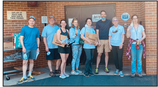
SPRING YARD CLEAN-UP CREW FROM THE HIGHLAND PROGRAM

c/o Our Lady of Peace 2076 St. Anthony Ave., St. Paul, MN 55104 (651) 696-8425 • paulaf@ourladyofpeacemn.org