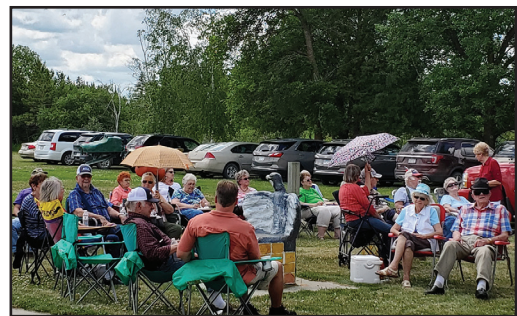
PICNIC IN THE PARK, WITH LIVE ENTERTAINMENT, HOSTED BY MIDDLE RIVER-THIEF LAKE

120 2nd St. S., Middle River, MN 56737 (218) 222-4466 • mrtllahbnp@wiktel.com