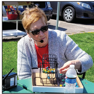
CAR BINGO HOSTED BY NOKOMIS HEALTHY SENIORS