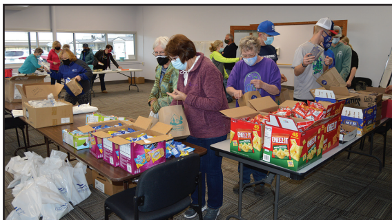
VOLUNTEERS ASSEMBLING MAY DAY BAGS FOR DELIVERY BY NORTH SHORE AREA PARTNERS

36 Shopping Center Road, Silver Bay, MN 55614 (218) 226-3635 • director@nsapartners.org