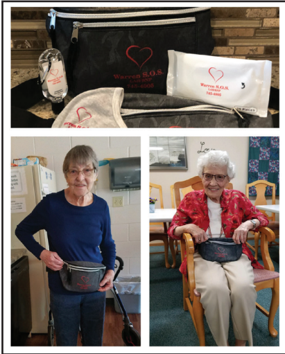
FANNY PACKS WITH COVID-19 SAFETY SUPPLIES GIVEN BY WARREN S.O.S.

110 W Johnson Ave, Suite 1, Warren, MN 56762 (218) 745-4005 · msjts@ruralaccess.net