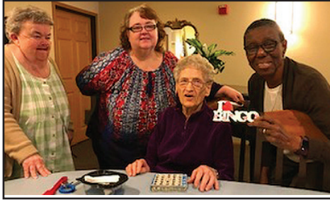
BINGO TIME HOSTED BY COMO PARK FALCON HEIGHTS

Como Park Lutheran Church 1376 Hoyt Ave. W, St. Paul, MN 55108 (651) 642-1127 • Office@comobnp.org