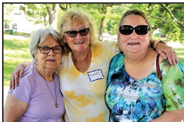
PICNIC HOSTED BY EAST SIDE ELDERS

The Fetch! grocery delivery program reached over 85 seniors each month. We hosted two COVID-19 vaccine clinics, providing vaccination for over 450 community members.