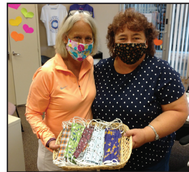
FACE MASKS SEWN BY GRANITE FALLS VOLUNTEERS

752 Prentice St., PO Box 84, Granite Falls, MN 56241 (320) 564-3235 · marklahbnp@mvtvwireless.com