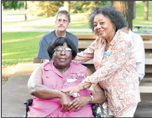
HAMLIN MIDWAY (ST. PAUL) ICE CREAM SOCIAL (IN 2019)

1514 Englewood Ave, St. Paul, MN 55104 (651) 209-6542 • tom@hmelders.org