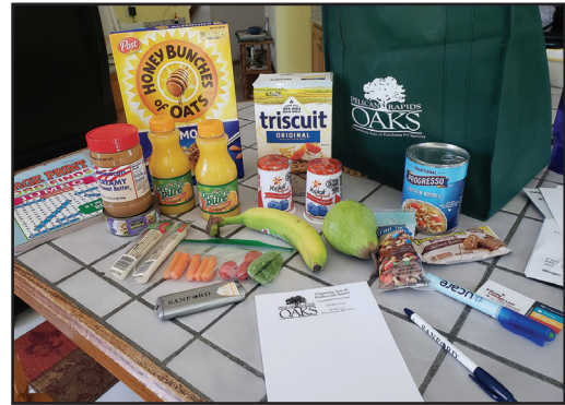
OAKS (PELICAN RAPIDS) PICK-ME-UP PACKAGES