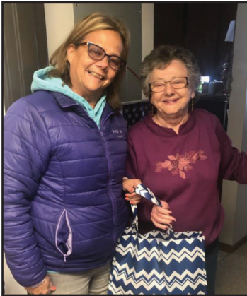
ATWATER FRUIT AND VEGETABLE DELIVERY (IN 2019)

P.O. Box 64, Atwater, MN 56209 (320) 974-8737 · lahbnp@frontiernet.net