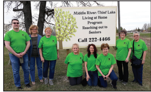
MIDDLE RIVER BOARD MEMBERS WITH BILLBOARD

120 2nd St. S., Middle River, MN 56737 (218) 222-4466 • mrtllahbnp@wiktel.com