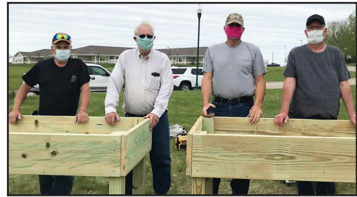
GRANITE FALLS MEMORY GARDEN CONSTRUCTION

752 Prentice St., PO Box 84, Granite Falls, MN 56241 (320)-564-3235 · marklahbnp@mvtvwireless.com