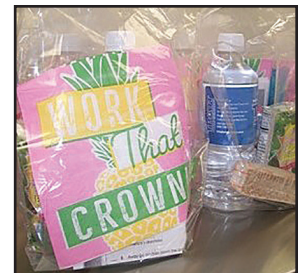
HELPING HANDS (HOLDINGFORD) CARE PACKAGES

Since the pandemic began, we have been delivering themed care packages to our clients that consist of fresh produce, food items tied to the theme and a 5-page booklet of brain activities such as trivia, silly jokes, and puzzles. The booklet has been a big hit and many clients don’t want us to stop them, even when the pandemic is over.