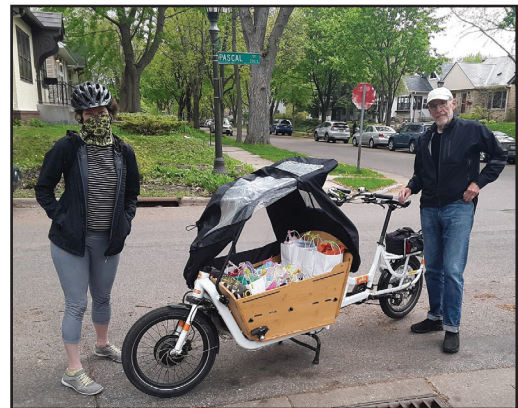
NEIGHBORHOOD NETWORK (ST. PAUL) DELIVERY