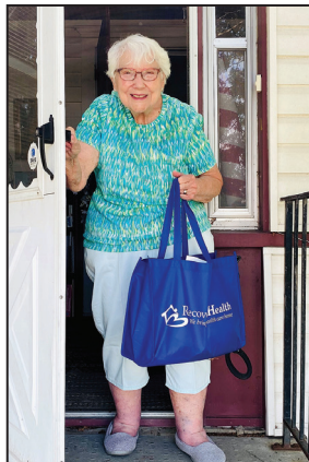
NORTH END-SOUTH COMO (ST. PAUL) CARE PACKAGE DELIVERY