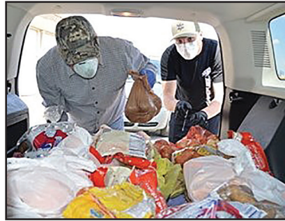
CARE (FOLEY) FOOD DISTRIBUTION

The 32 member programs of the Living at Home Network (LAHN) quickly responded to the challenge of helping older adults while in the midst of a coronavirus (COVID-19) pandemic. With Minnesota's "Stay at Home" order, network programs checked in with elders to see what they needed, what worries they had, and to assure them their local program was there to help. When we realized the COVID-19 precautions and restrictions for older adults had an uncertain timeframe, programs found creative ways to reduce the social isolation caused by the restrictions. Delivery of services continued strong as programs adapted to conform with the public health guidelines. As a network, programs worked together to innovate and transform needed services.