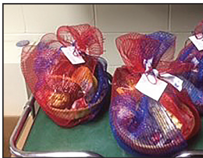
HIGHLAND (ST. PAUL) JULY 4TH TREATS